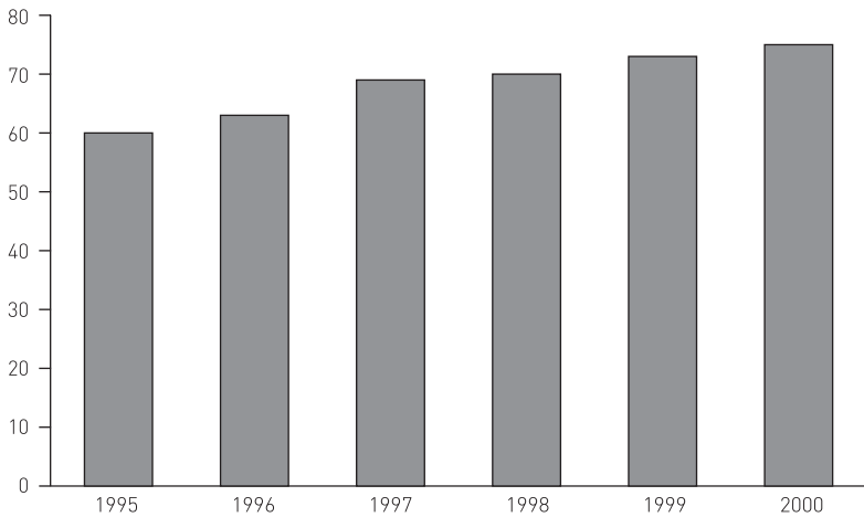
Figure 3.1 Foreign tourist visitors to France, 1995–2000 (millions)